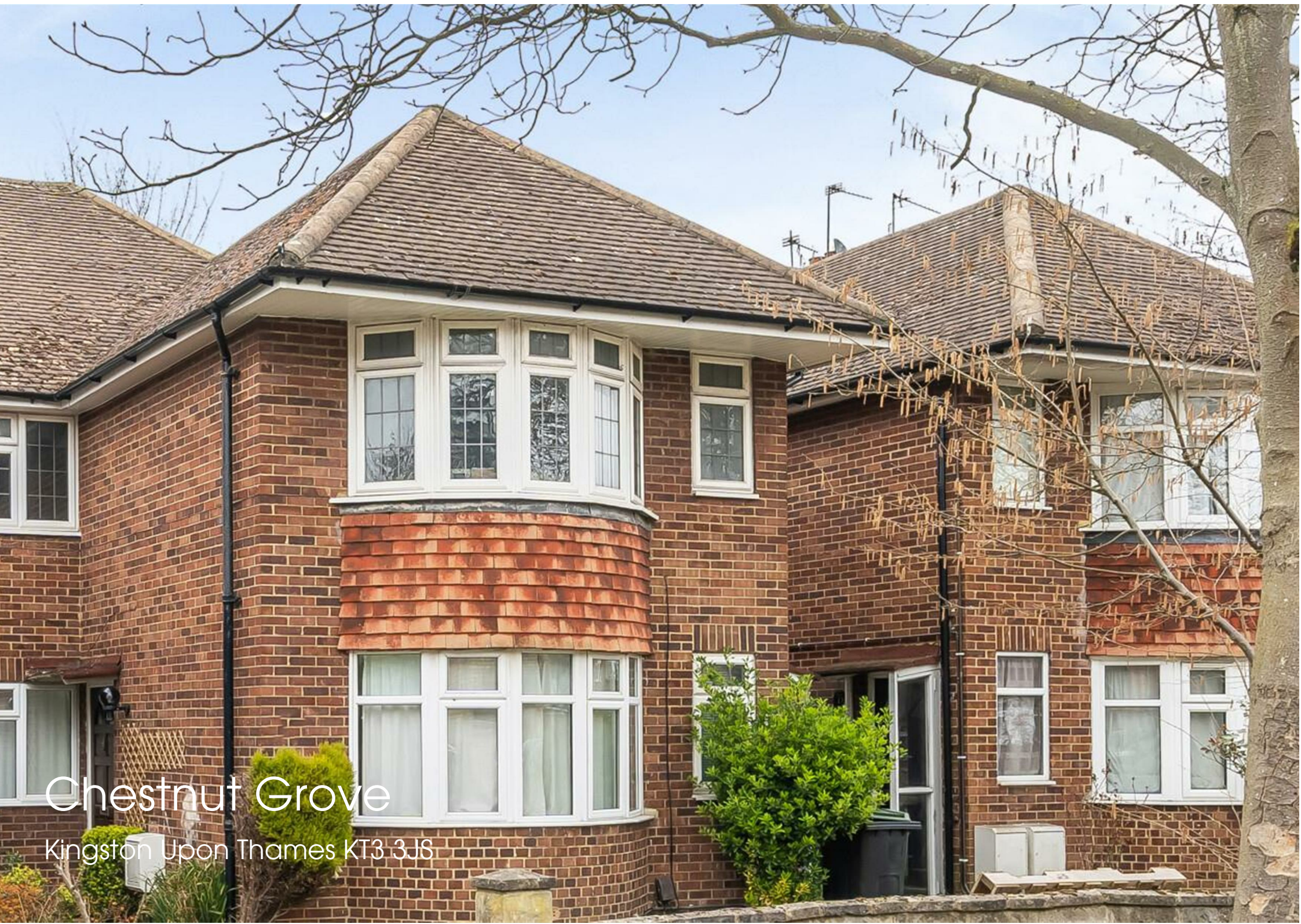
Chestnut Grove Kingston Upon Thames KT3 3J6